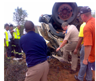
One of the terrible accidents which took place between Christiana and Jan Kempdorp area during December 2008.

All responsible drivers must be cautious of others during this time of the year and bear in mind that Lekwa-Teemane loves you and would like you to have a safe journey to and from your various destinations. TAKE CARE AND ENJOY YOUR JOURNEY.