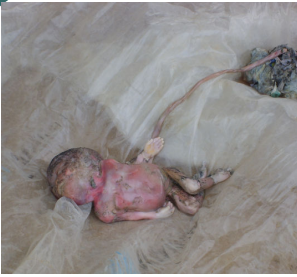
The above abandoned body with an umbilical cord was found dead in the sewer dumping site near Geluksoord, Christiana.